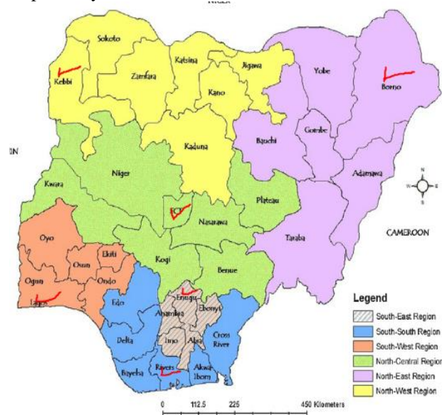
Figure 3.0 Regional Map of Nigeria

RETScreen software was used to simulate the geographical, environmental and solar PV module parameters. Data for six locations which uses radiation data from NASA and Ground measurement was obtained and analyzed. It was found that NASA source data varies over a wide range depending on whether it is collected from monitoring stations, extrapolated, or derived from satellite information. In order to evaluate the environmental factors associated with Solar PV performance, technological and design factors are kept constant while factors that are specific to geographical locations are varied. One Location is taken from each of the six geographical zones in Nigeria as climatic variation is minimal within a region. The latitudes at the locations are used as the optimum tilt angle for the PV module in fixed tilt orientation to maximize Irradiation and to ensure same condition for all locations. Simulations was done for both Fixed tilt and Single axis tracking Scheme, leading to a total of 24 simulations with 4 in each location. These include Abuja, Birnin-Kebbi, Enugu, Lagos, Port Harcourt and Maiduguri as highlighted in Figure 3.0. Assumption used in RETScreen for Mono-Silicon and Amorphous Silicon modules are given in Table 3a and 3b respectively.